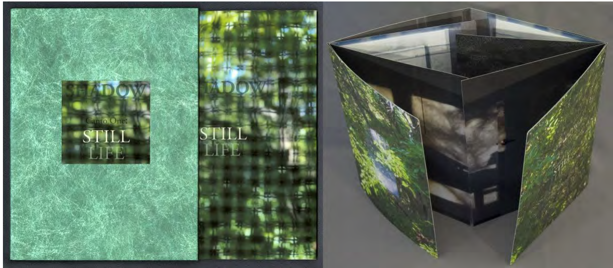
View of slipcase, front cover and standing book work

Still Life is the first canto of Shadow Quartet . This quartet is an artist's book variation on the long poem format. Each canto is a discrete manifestation of the shadows cast by our daily activities within domestic spaces. Each title references an undervalued art genre and reflects my longstanding attraction to the poetic potential of the overlooked and dismissed aspects of daily lives.