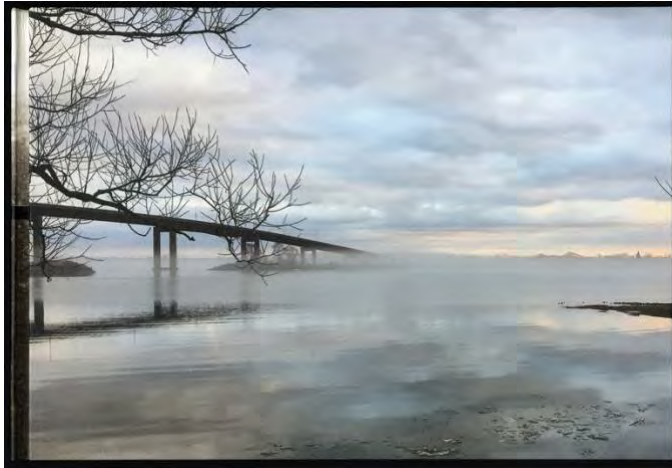
View of front cover

Travelogue is the fourth and final canto of Shadow Quartet . This quartet is an artist's book variation on the long poem format. Each canto is a discrete manifestation of the shadows cast by our daily activities within domestic spaces. Each title references an undervalued art genre and reflects my longstanding attraction to the poetic potential of the overlooked and dismissed aspects of daily lives.