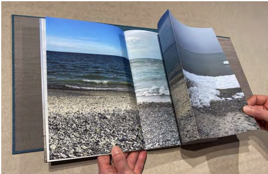
Expanding the accordion spread for section one: fluctuate

In early June of 2020, to mark the end of my regular walks, I began to photograph at the edge of Lake Ontario, always from the same south-facing vantage point. Over the following months and years, I slowly amassed a visual record that reflects the ever-changing conjunction of sky, water, and land.